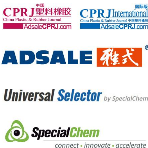
Pic1: Adsale Publishing Ltd partners with SpecialChem to promote Universal Selectors online databases.

The Universal Selectors, which gathers more than 135,000 datasheets, are accessible in English on Adsale website starting June 15, 2016. The Chinese version will be launched later.