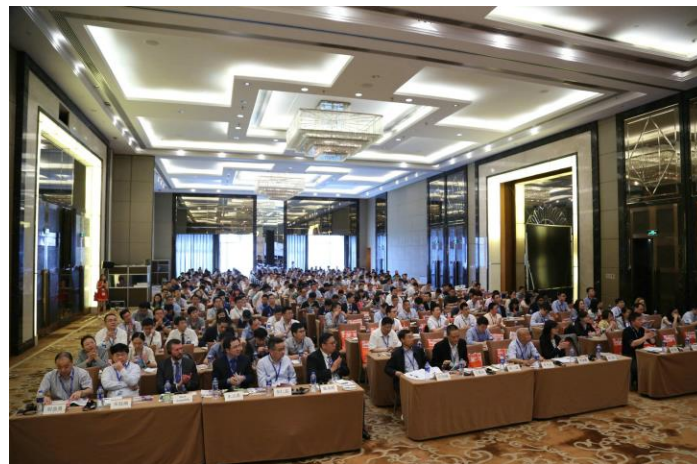
Pic 3: AdsalePublishing Ltd also organizes conferences and specialized exhibitions for professionals in the plastics and rubber industry.

In addition, CPRJ organizes conferences and specialized exhibitions for professionals in the automotive, packaging and consumer electronics sectors.